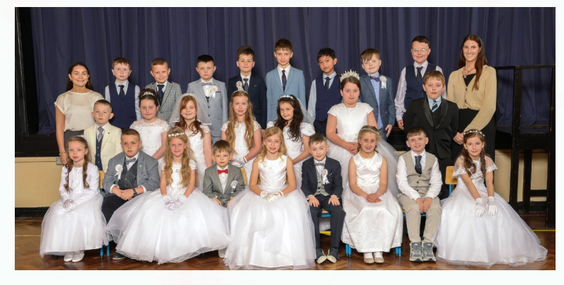
Well done and congratulations to the boys and girls who celebrated their Confirmation on the 11th of April and who received their First Holy Communion on the 11th of May. Many thanks to our fantastic Parents' Association for the wonderful Communion celebration in the halla.