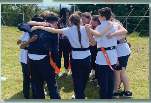
It was a tense game of tag rugby between the staff and the students. There was great sportsmanship to be seen. Well done to all involved!