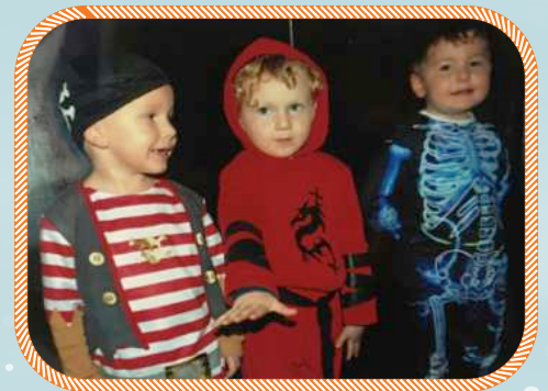
The children (and teachers!) were delighted with the return of our Halloween disco this year. The children looked fantastic in their costumes and danced the day away! There was also lots of fun pumpkin painting. Thanks to the Parent's Association for organising such a fantastic day!