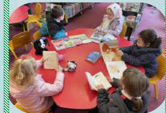
It's always lovely when we get to take trips as a class. Lots of classes were lucky enough to take a trip to Mayfield Library. They enjoyed reading their favourite stories together.