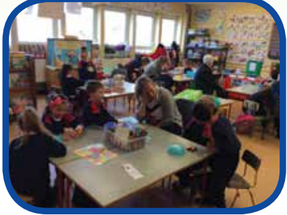
Maths is all around us! 5th class's thirst for maths was clear in their careful measurement of fruit juices. Early Start and 1st class children have been busy using their maths eyes! Meanwhile, parents were welcomed into Senior Infants as part of the Maths for Fun initiative.