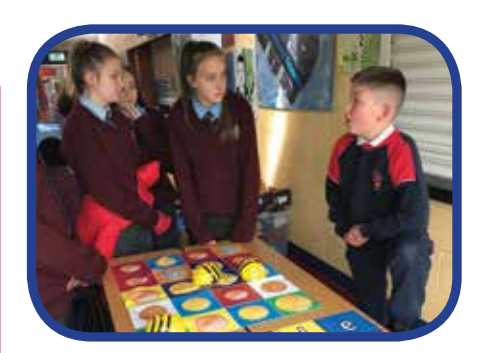
After a hugely successful year of the digital project, the very first showcase was held in Mayfield Community School on May 15th. The classes from SMAE were out in force sharing all of their new found coding and engineering skills!"