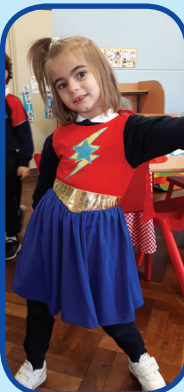
Fa"boo"lous fun was had during our Halloween celebrations this year, with fang-tastic costumes, traditional games in the classrooms and our annual Halloween disco, which was ably organised by our wonderful Parents' Association.