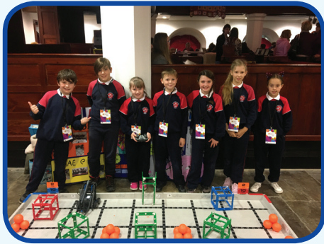
Representatives from 4th Class enjoyed a day out at the Triskel Art Centre in Cork City as part of the Creative Schools Programme. The pupils showed off their VEX Robotics project, wowing the other schools.