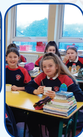
The hot meals at lunch time are hugely popular with the children and the scheme has been a great success. Pictured are some of our 6th class pupils enjoying their first hot school lunch!