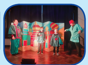
Tremendous fun was had when the school was visited by West Midlands Children's Theatre Company who staged a wonderful performance of "The Bluebird of Happiness". Audience participation was encouraged and the children were more than happy to oblige!