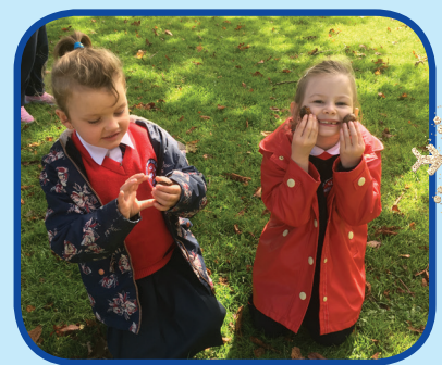
Autumn brought with it some beautiful sunshine; ideal weather for school walks, teddy bear picnics and nature table scavenger hunts!