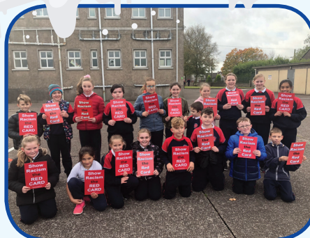
Well done to both 4th and 5th class who took part in an educational workshop hosted by the anti-racism charity, Show Racism the Red Card.